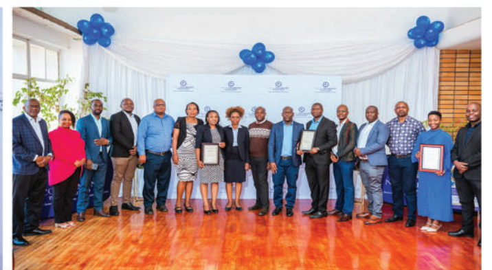
SAZ and NicozDiamond Insurance team at the celebration ceremony

This certification reinforces a culture of continuous improvement and collaboration by the NicozDiamond Insurance team. It establishes a structured framework that guides us to consistently refine our processes, allowing us to deliver the best possible outcomes for our clients. The certification promotes efficiency, accountability, and a shared commitment to excellence across all levels of our organisation. By obtaining this prestigious certification, NicozDiamond Insurance distinguishes itself as an industry leader, setting a new standard for quality in the local insurance sector. This achievement not only strengthens its competitive edge but also highlights our commitment to staying ahead in a constantly evolving market.