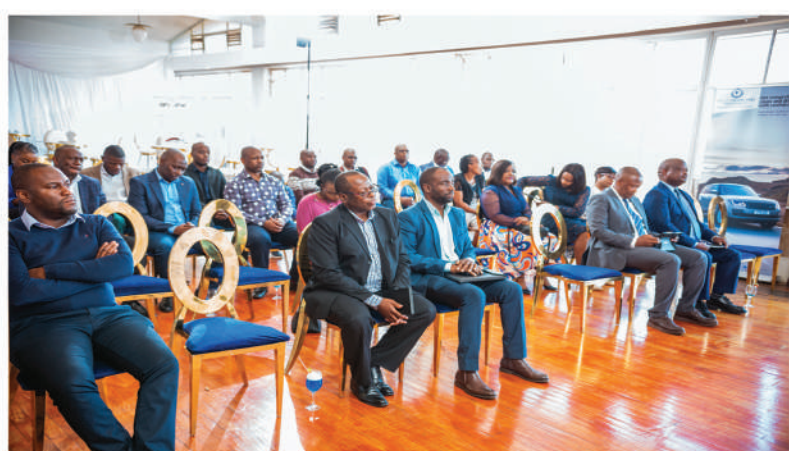
Guest following proceedings at the ceremony.