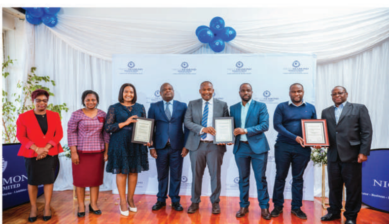
NicozDiamond Insurance team celebrating the ISO Certification achievement.

The journey towards excellence doesn't stop here. The business is committed to maintaining and expanding upon this certification by continually investing in staff training, integrating ISO principles across all its operations, and fostering a robust internal auditing process and the focus on innovation, quality, and improvement will ensure that it remains a trusted partner for all its clients, offering insurance solutions they can depend on. NicozDiamond has well established linkages with key intermediaries, coupled with the successful adoption of alternative distribution channels which have supported its growth and profitably and offers a wide range of personal and commercial insurance products as follows: